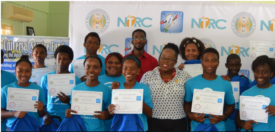
Graduates of myApp Summer Program 2016